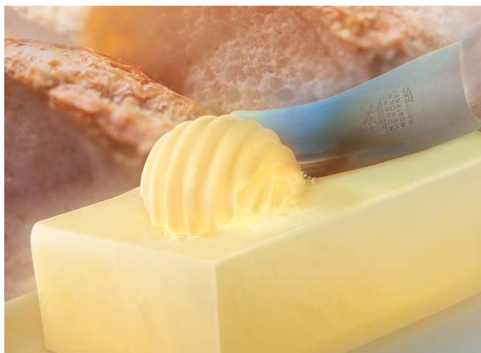
Butter Making and Butteroil Installations | 8