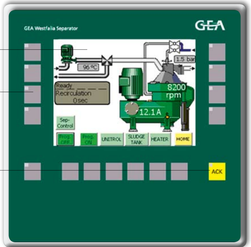
Westfalia Separator® unitrol plus E40 control unit