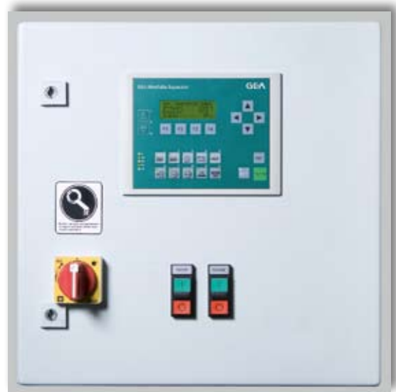
Compact device D10

The control unit is a linear display device, with an image accordingly being built up from static text and/or current status displays for the separator system.