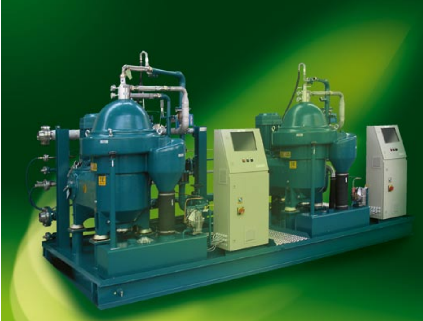
Distillate fuel oil treatment plant