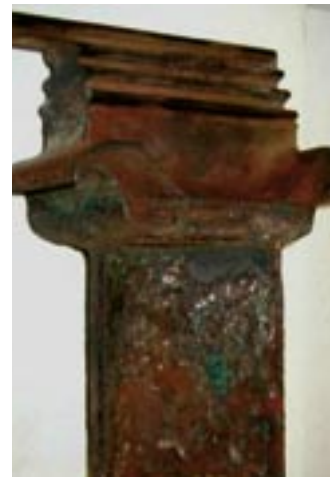
Hot gas path corrosion at a first stage turbine blade